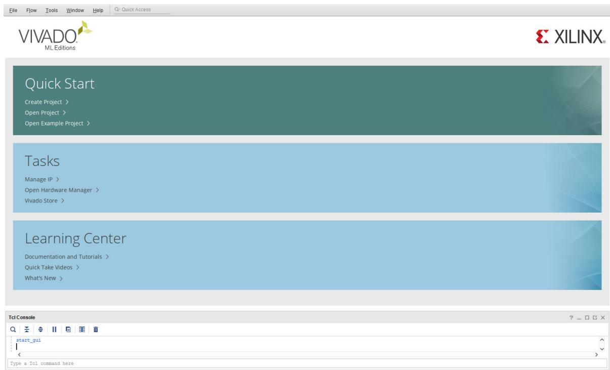
Figure 2: Vivado IDE Getting Started Page

When you launch the Vivado IDE, the Getting Started page, shown in the following figure, displays and provides you with different options to help you begin working with the Vivado Design Suite.